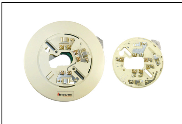
SCI-B6 & SCI-B4